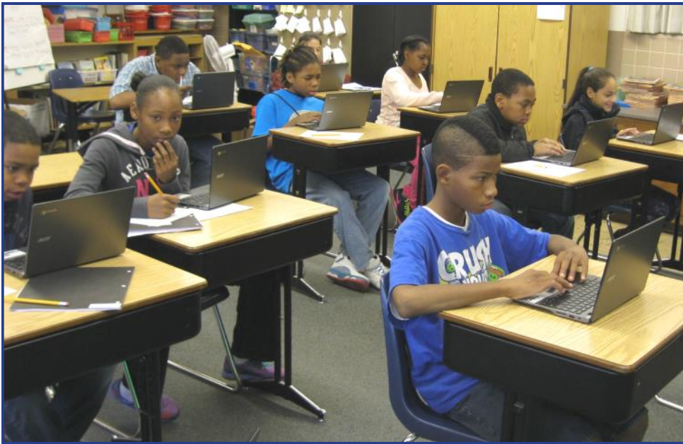
While each school's needs are different, some are adding cost-effective Chromebooks to local classrooms.